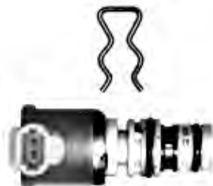
3-2 Solenoid (Deleted in 09)

We have no Hybrid Vehicle Plates at this time.