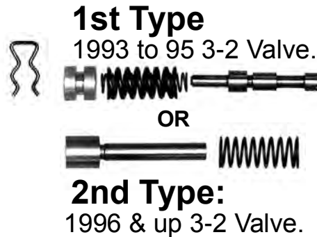
1st Type 1993 to 95 3-2 Valve.